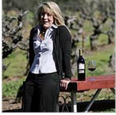
Special Section: Retirement