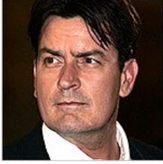
Why His Face May End Up in Webster's